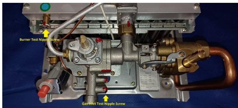
Primo 11 (MP11)

The early indications point to the test nipple screws (gas inlet and burner pressure) not being tightened and checked correctly for any gas leak as per the installation manuals after the appliances have been commissioned, serviced or maintained. The below pictures show the exact location of the test points on each of the affected appliances.