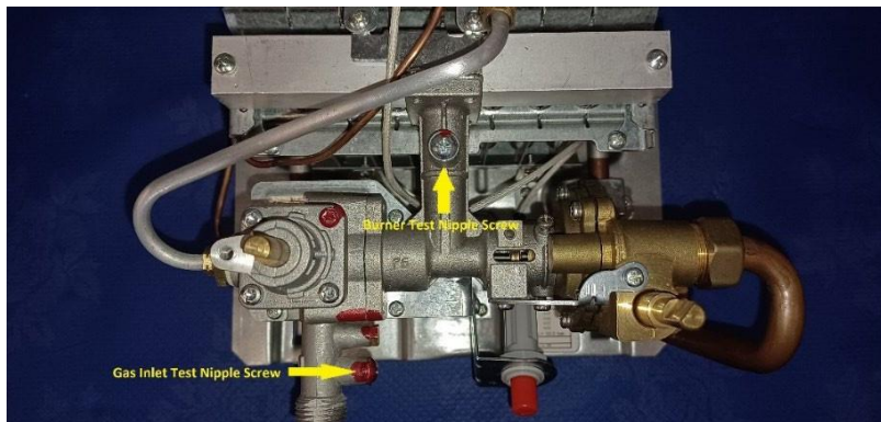
Primo 6 (MP6)