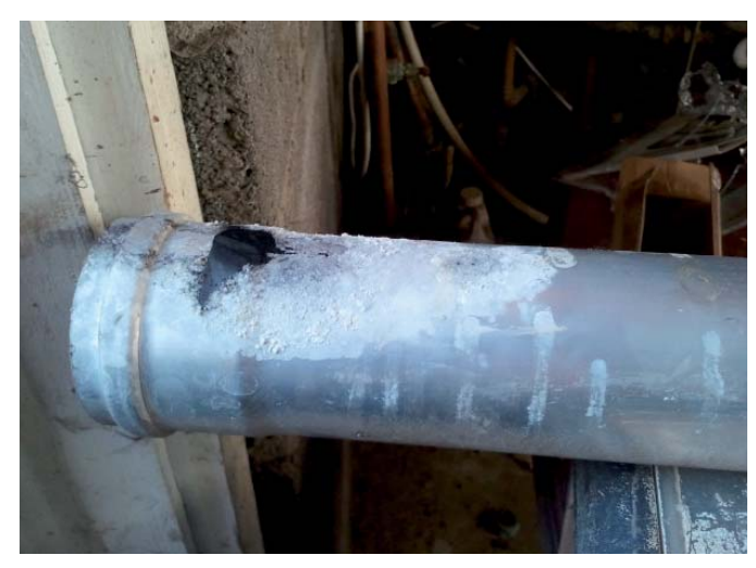
This flue pipe was discovered by a Registered Gas Installer on a boiler which showed signs of flame lift. This is the inner combustion tube taken from the boiler. The result of condense forming in the flue and attacking the metal (this is a non-condensing boiler) Its imperative that the correct fall as specified by the manufacturers is achieved on flue runs.

Turn on gas at main valve. Soap test inlet and pressure point and re-light all appliances.