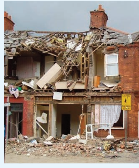
Think safe, be safe

If isolating the gas at the meter the network operator must be informed i.e. Bord Gáis 1850205050. Notification of Hazards are supplied free of charge from R.G.I.I. and on this occasion a book of 10 is supplied to every RGI with this newsletter.