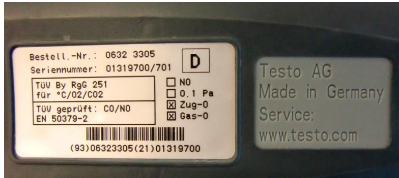
Figure 1 – Showing the specification plate on the rear of the instrument (check [Bestell Nr] against numbers of affected instruments as given in Table1 ).