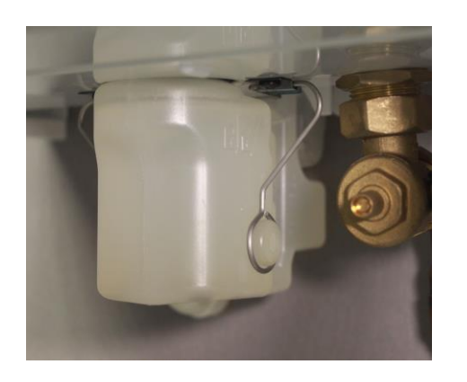
Figure 2 New Retaining Clip