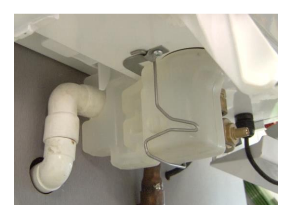
Figure 3 General Access - Location of condensate trap and retaining clip